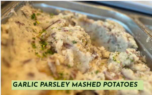
GARLIC PARSLEY MASHED POTATOES