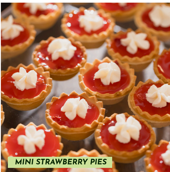
MINI STRAWBERRY PIES