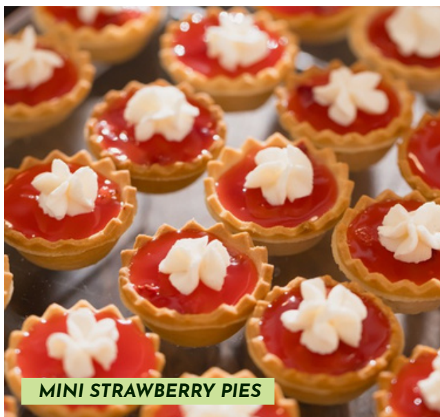
MINI STRAWBERRY PIES