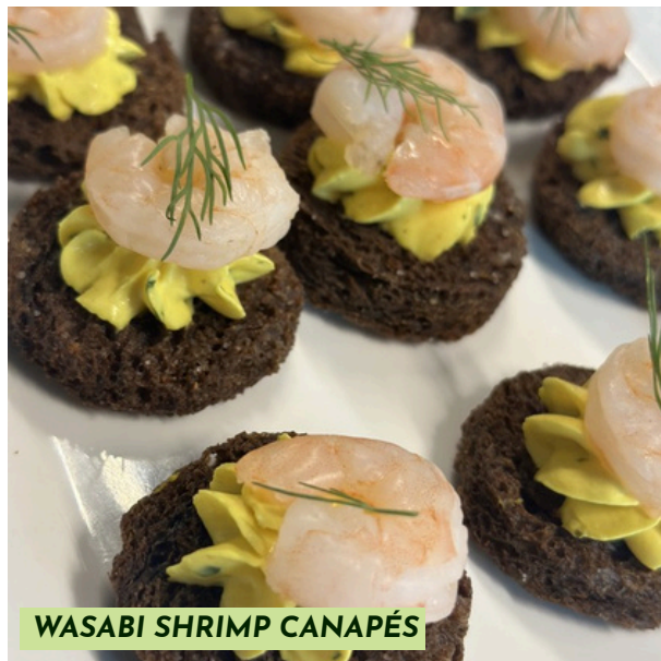
WASABI SHRIMP CANAPÉS