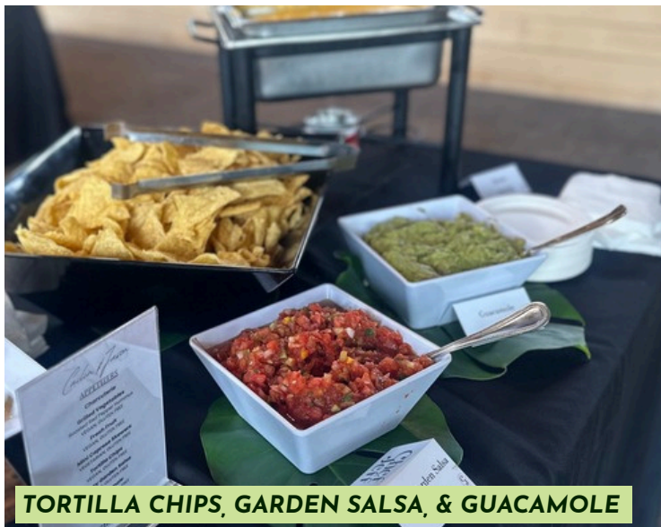
TORTILLA CHIPS, GARDEN SALSA, & GUACAMOLE