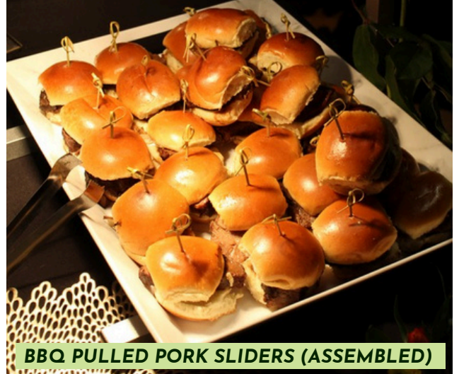
BBQ PULLED PORK SLIDERS (ASSEMBLED)