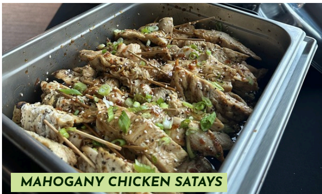
MAHOGANY CHICKEN SATAYS