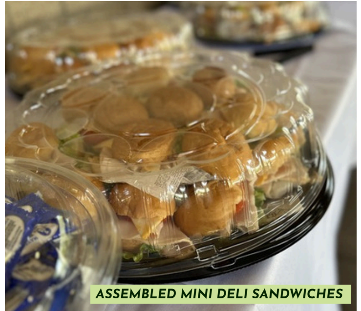
ASSEMBLED MINI DELI SANDWICHES

MINI SANDWICHES PRE-ASSEMBLED ON DOLLAR ROLLS WITH DELI SLICED MEATS, SLICED CHEESES, LETTUCE, TOMATOES, AND CONDIMENTS. DEFAULT OPTIONS ARE HAM & SWISS AND TURKEY & COLBY JACK