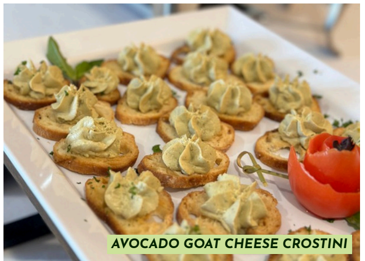
AVOCADO GOAT CHEESE CROSTINI

SHRIMP & SIRACHA CREAM CHEESE MOUSSE, GARNISHED WITH DILL