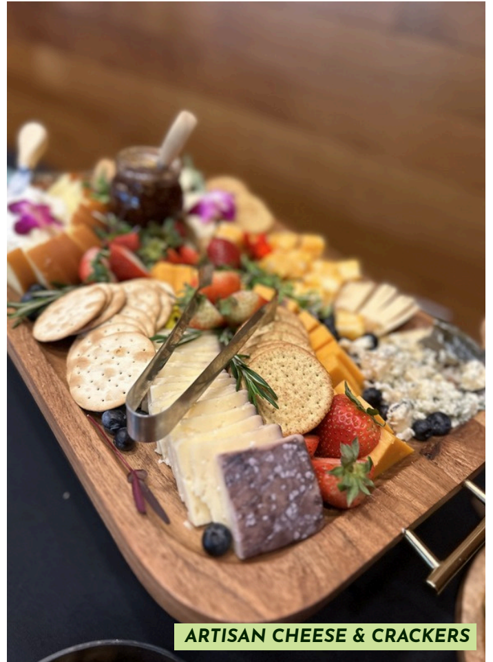
ARTISAN CHEESE & CRACKERS